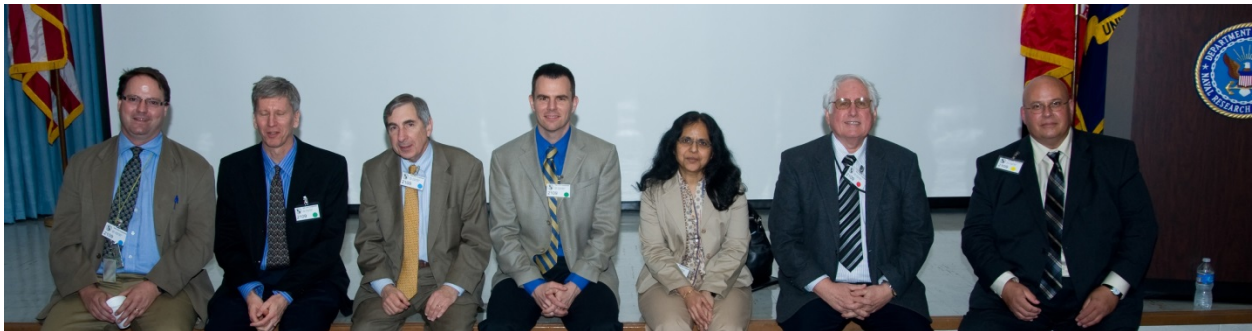
Organizers of the last NRL-AOC Capitol Chapter EW Symposium are looking forward to seeing you at the next one!

NRL Symposium – Draconian rules limiting knowledge exchanges have been relaxed and we are once more working diligently on providing a classified symposium under the aegis of the NRL. This is currently scheduled for first week in May. The last NRL-Capitol Club symposium on EW Communications was widely praised. Make sure we have your current email address so we can keep you informed and allow you to sign up early!